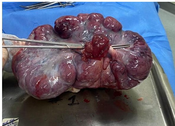
Figure 1: Left ovarian solid tumor (Dysgerminoma).