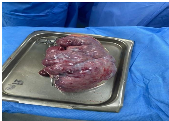
Figure 2: Ovarian mass with a cerebroid and lobulated appearance.