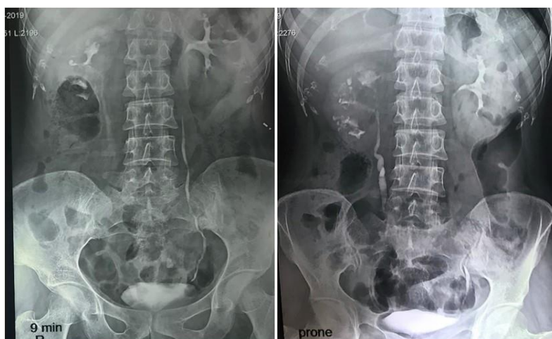
Figure 1: IVP film showed distorted calyces in right Kidney. Some of the calyces were feathery and moth-eaten in right kidney. Infundibular stenosis was seen in upper pole calyces. Midpolar calyx was also narrow in right kidney. The right ureter was irregular in outline, tortuous however normal in calibre. Upper pole of right kidney and left Kidney showed contrast outpouching.

A 42 years female presented with frequency, low-grade fever, and flank pain. On evaluation blood investigations were normal. On urine, microscopy showed plenty of pus cells and urine culture was sterile. Ultrasound showed right bilateral normal kidney with right mild hydronephrosis. Intravenous pyelography (IVP) was done which suggested the right Kidney having irregular distorted calyces. Few of the calyces were feathery and moth-eaten. Upper pole infundibular stenosis was seen. Midpolar calyx was also narrow. The right ureter was irregular in outline, tortuous however normal in calibre. Contrast outpouching was seen in the upper pole of right kidney and left Kidney (Fig. 1). Urine for mycobacterium bacilli was positive. Cystoscopy was done which suggested cystitis (Fig. 2).